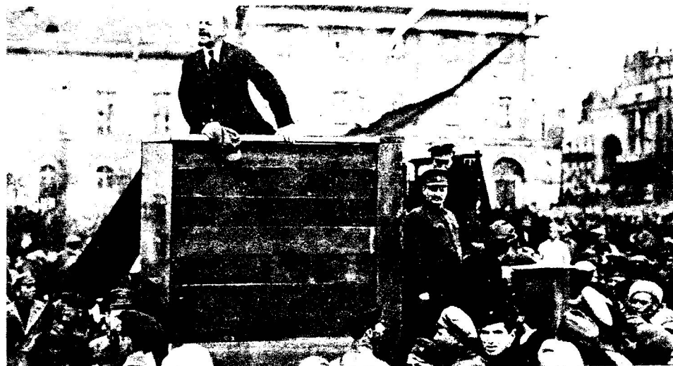
LENIN AND TROTSKY

Detroit, April 15, throughout the country the workers, engaged in a bitter